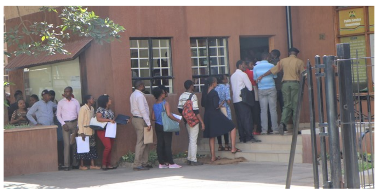
Applicants queue outside Commission House as they wait to submit their applications in April 2019