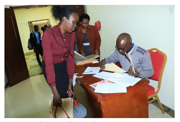
A Ministry of Health official verifying a candidate's documents before the interview