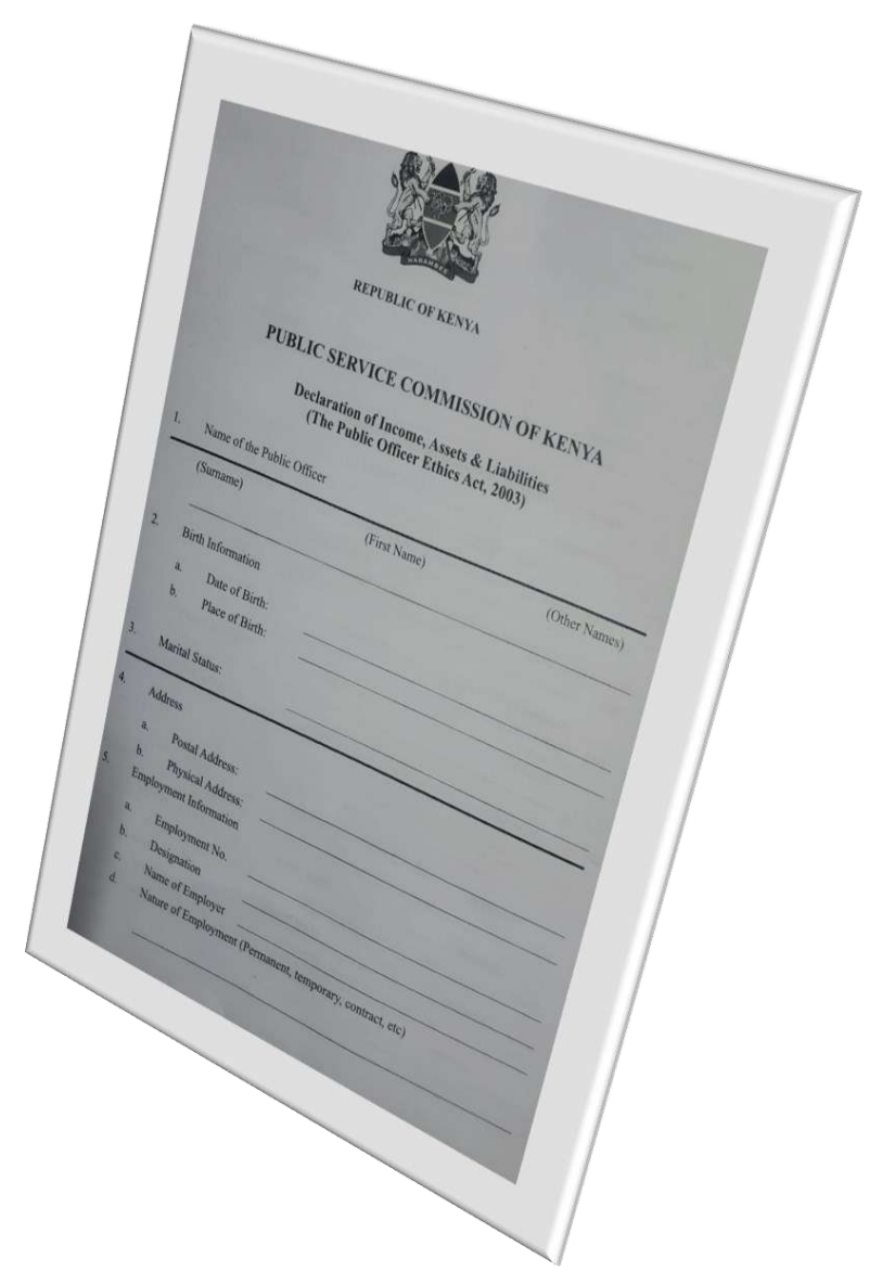
A sample of the Wealth declaration form

Public officers are advised to take personal responsibility for the completeness and accuracy of the information submitted to the