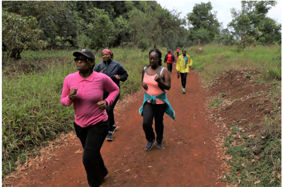
PSC Staff, family and friends jogging during an outdoor fitness excursion at the Karura Forest

This kind of feedback is an indicator of what can be expected from well-organized health and fitness programs not only at the Public Service