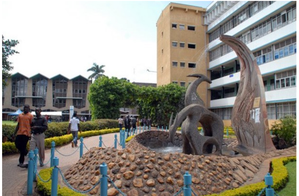
The 'Fountain of Knowledge' monument at the University of Nairobi

the Commission House along Harambee Avenue, Nairobi on Wednesday 18 th December 2019 from 8.30 a.m. to 5.00 p.m.