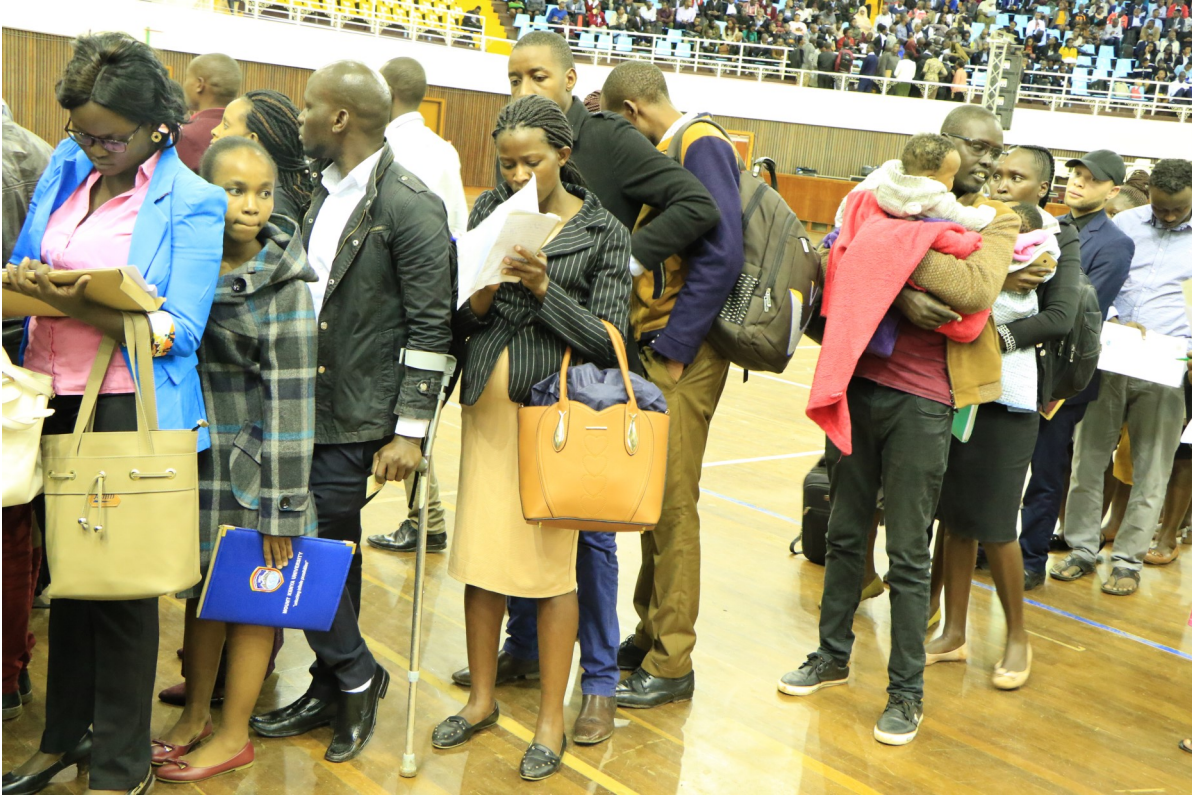
Successful interns under Public Service Internship Programme queue during registration