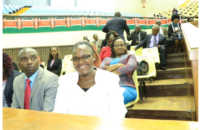
A section of PSC staff and other officers follow the proceedings of the interns induction programme