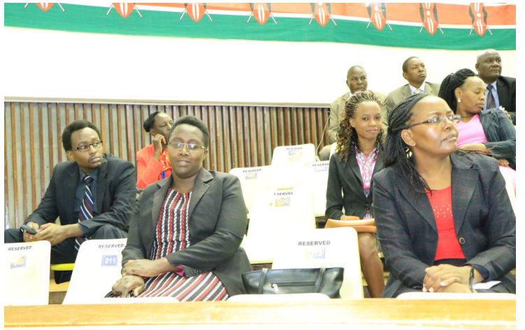
A section of PSC staff and other officers follow the proceedings of the interns induction programme