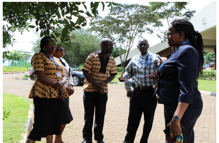
PSC staff talking during a tea break session at the Kasarani Gymnasium