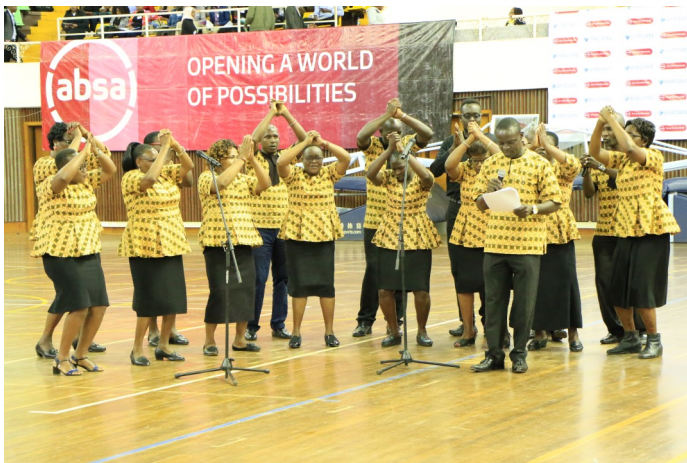
PSC choir performing during the interns induction programme