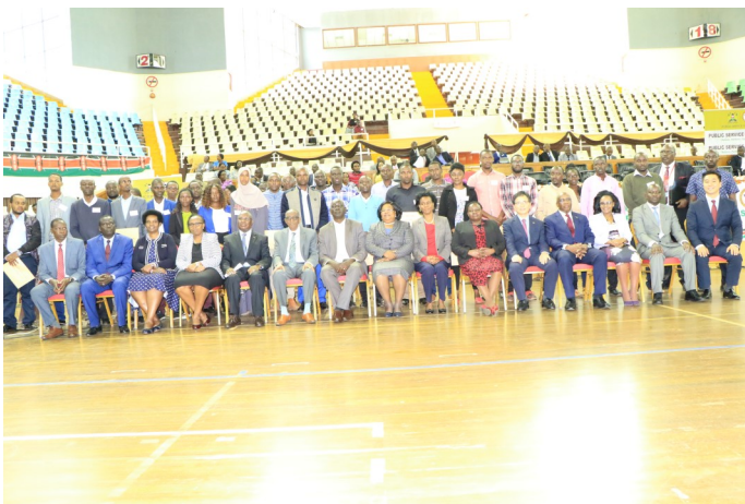
Dignitaries (Seated) in a group photo with selected interns