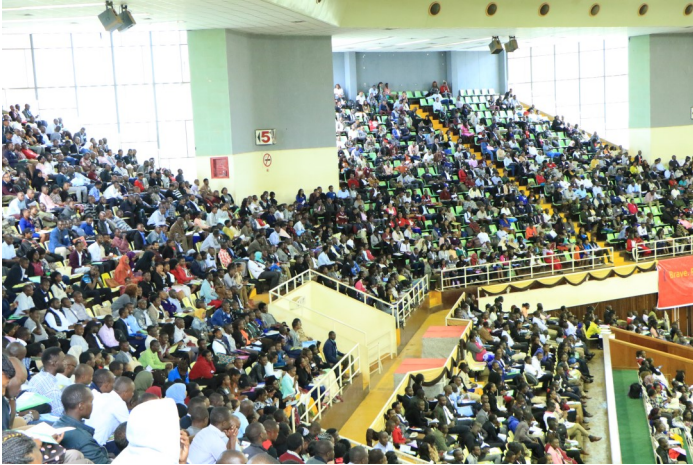
Interns following proceedings