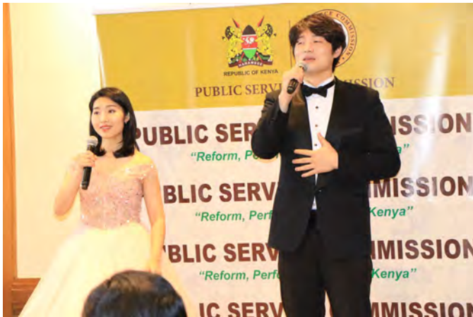
(IYF) Members entertain guests