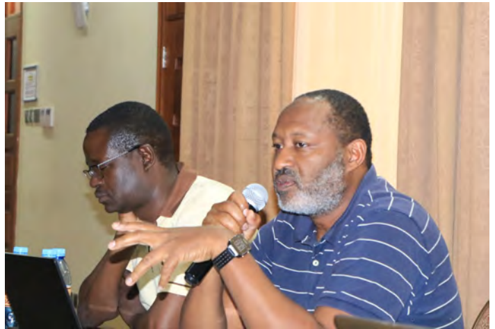
Deputy Director Performance Management & Public Service Delivery contributes to a discussion during the Strategic Policy Working retreat in Naivasha