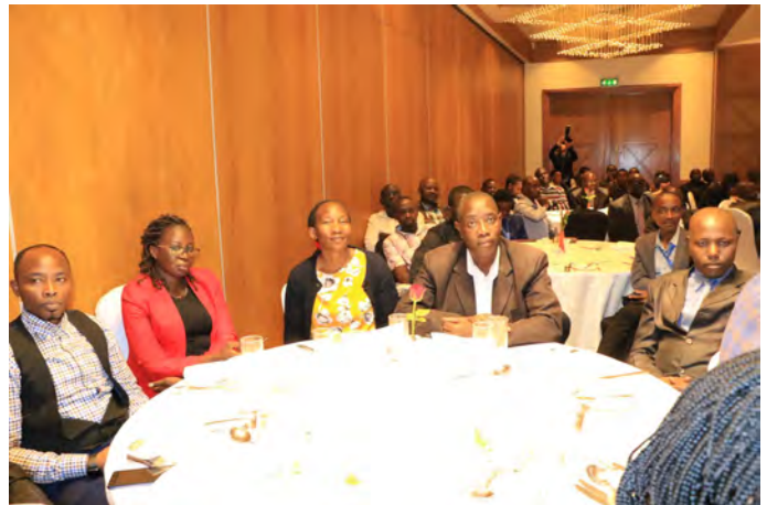
A section of PSC secretariat staff