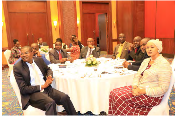
Guests following proceedings during the AAPSCOMS stakeholders consultative meeting