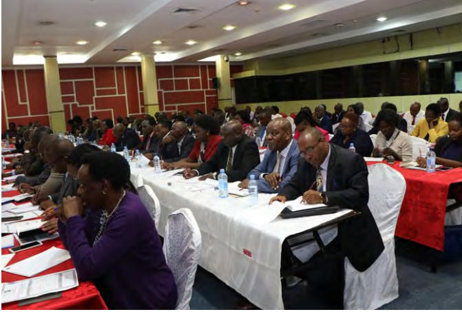
Left- Participants following the proceedings during the Consultative meeting on Management of Pensions at the KICC on 17 th April, 2019