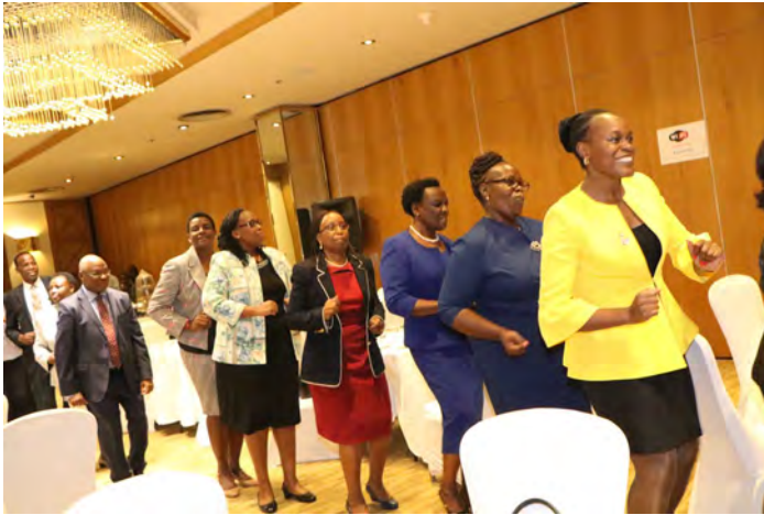
PSC Commissioners and staff dancing to Kayamba Africa tunes