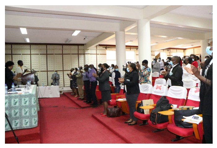
Participants during the launch of the capacity-building program for mentors and coaches from Ministries, State Departments and Agencies (MDAs) under the Public Service Internship Program (PSIP) at the Kenya School of Government, Embu campus